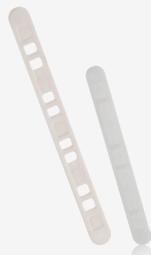
BIO VENDING STIRRER 90/105 mm Cream Color