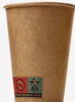
WATER PAPER CUP