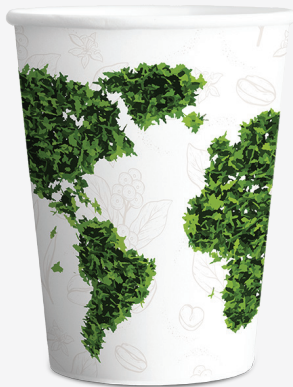
BIO PAPER CUP