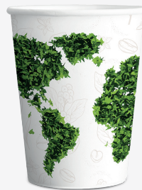
BIO VENDING PAPER CUP 5/6/7/8 oz Customized Design