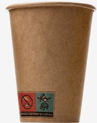
WATER PAPER CUP 4/5/6/7/8 oz Craft & White