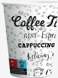
VENDING PAPER CUP 4/5/6/7/8 oz Customized Design