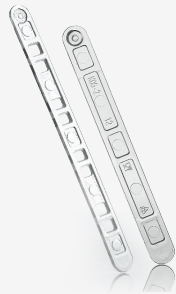
VENDING STIRRER 90/105 mm Transparent

Designed for PROFESSIONALS Disposable Product