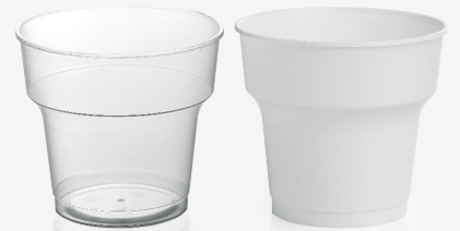
PLASTIC CUP 180 cc Transparent - All Color